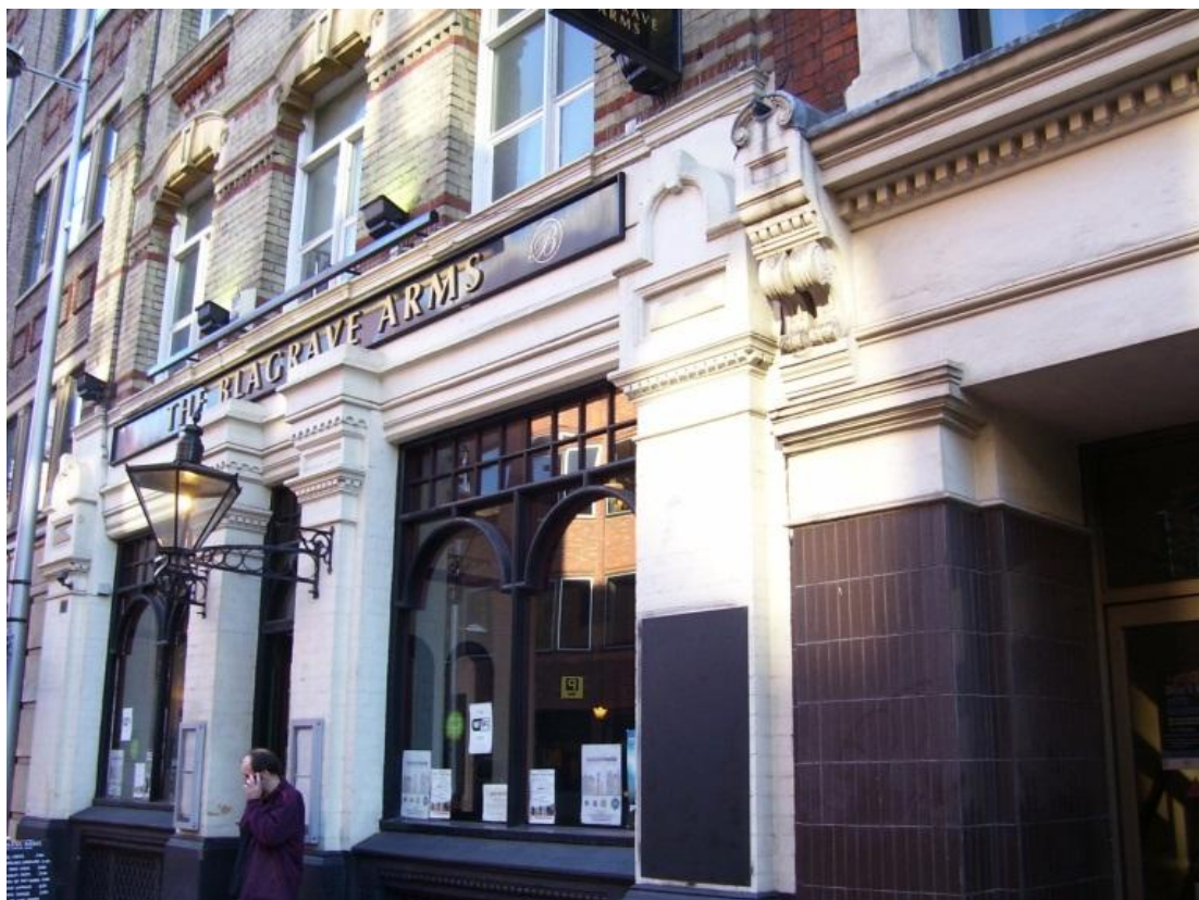
The Blaggrave Arms, Reading (see page 8)