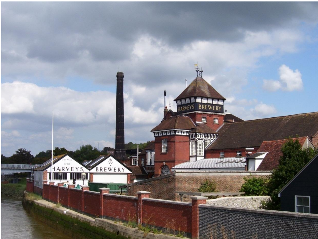
Harvey's Brewery, Lewes