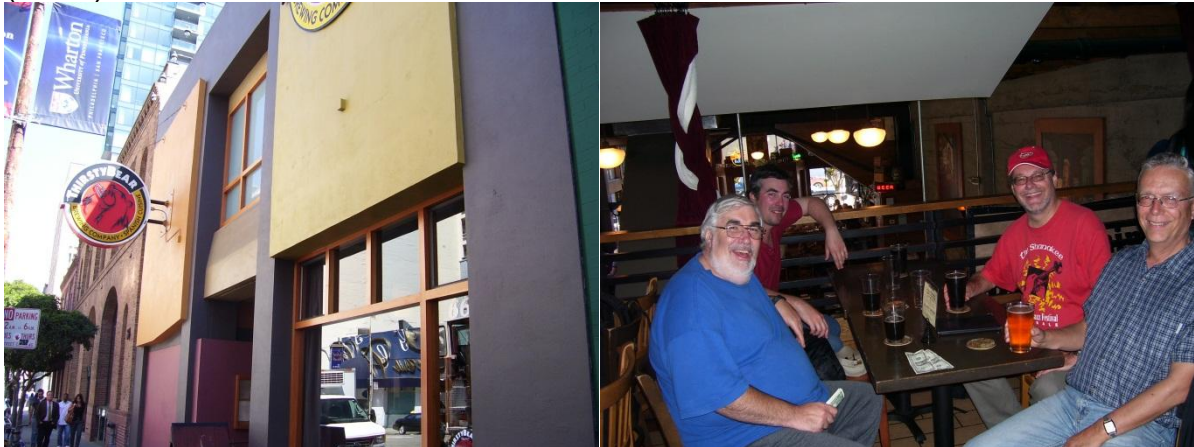
Outside the Thirsty Bear; inside the 21 st Amendment

being in the wrong place at the right time. The beer in question was a cask-conditioned stout flavoured with camomile – most unusual. Continuing to the 21 st Amendment (named after the Act which ended Prohibition in 1933) - with an impressive choice of craft beers - South Park Blonde (refreshing, 5.0%), 5-South American Pale Ale (5.5%, not from Peru or Brazil but named after Interstate 5 which runs the length of California) and Brew Free or Die IPA (7.0%).